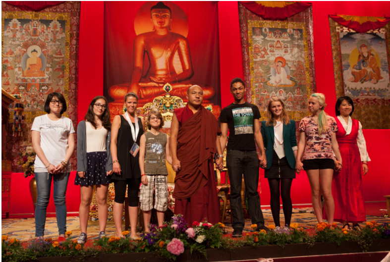
Berlin, 8 June 2014, Meeting with the Youth