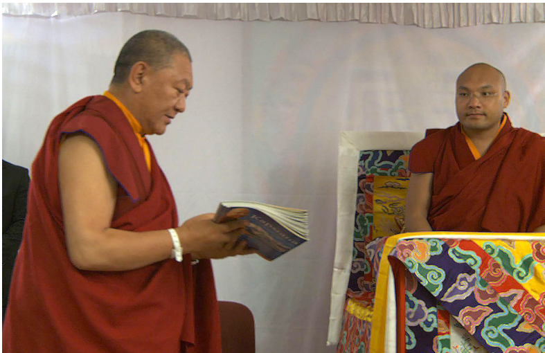
Kamashila Institute, 29 May 2014, Audience with KFE