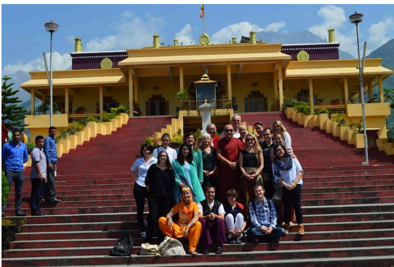
India Gyuto Monastery, August 2014, Meeting with European Young Professionals.